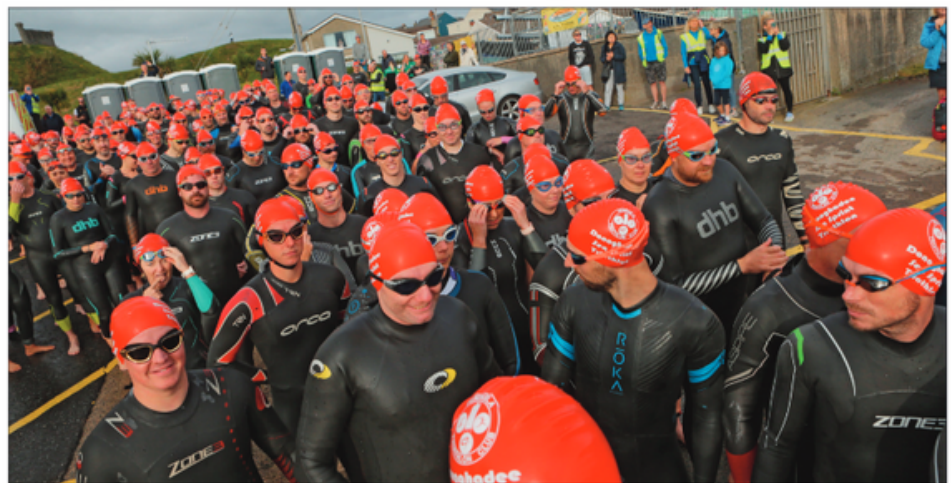
Competitors lining up for the swim section of Sunday's Donaghadee Sea Sprint Triathlon. B44-31-8-23

there was exceptional on-water support from Donaghadee Sailing Club, local kayakers and paddle boarders. The cycle route was marshalled at every junction with the Shore Road closure being supported by local PSNI, but it's the run section of this event where the spirit of the